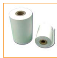
SPARE THERMO PAPER P/N: VM69811B SIZE: 38MM X 20M X 30@