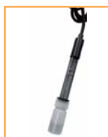
PH PROBE P/N:VZ86P3AZ (ATC PROBE) P/N:VZ86P2AZ (W/O ATC PROBE) P/N:VZ86P4AZ (W/O ATC PROBE) -Low ion strength P/N:VZ86P5AZ (ATC PROBE) -Low ion strength Size:12dia.x140mm, Cable length 1238mm,BNC connector